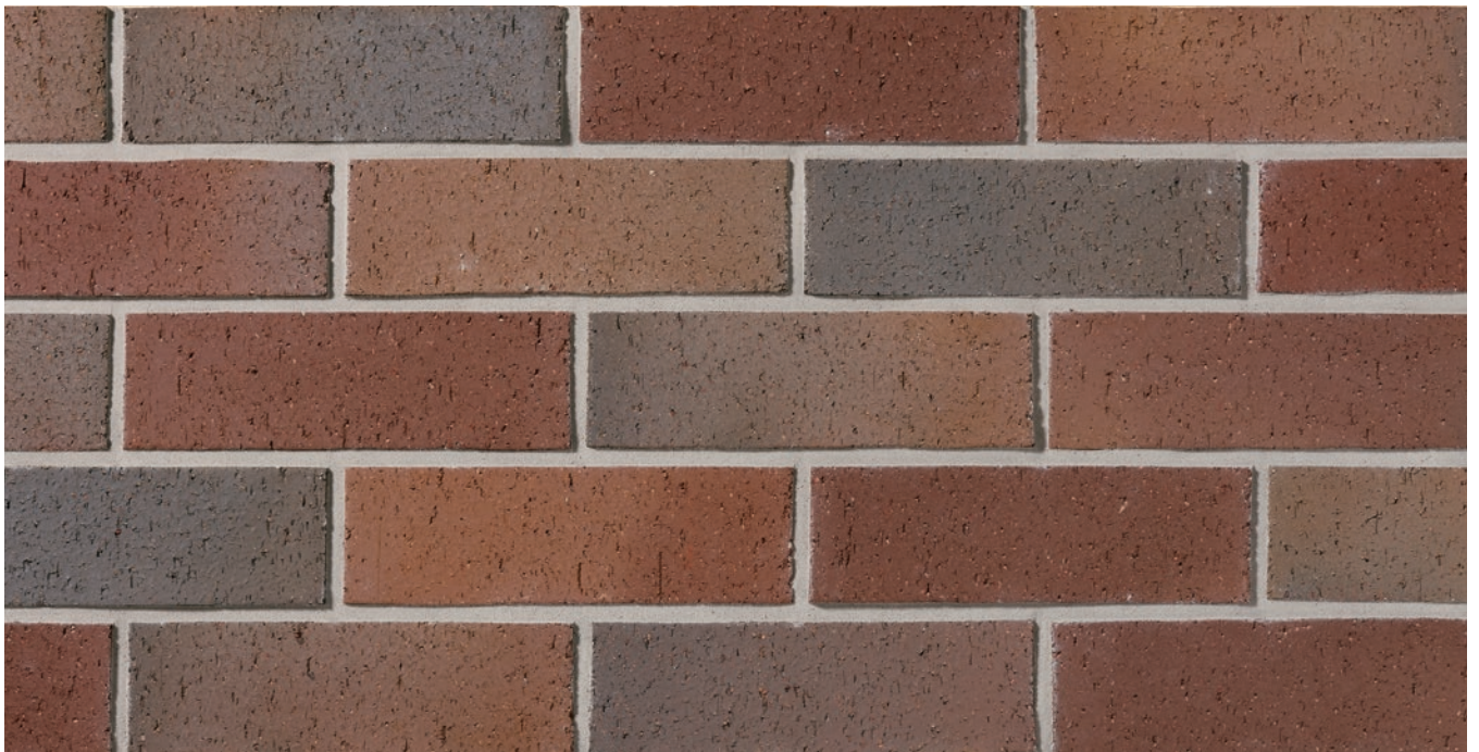
NEW! BROWN VELOUR FLASHED

AVAILABLE SIZES: Metric Modular, Modular, Premier Plus, Metric Norman, Metric Jumbo, Closure, Utility