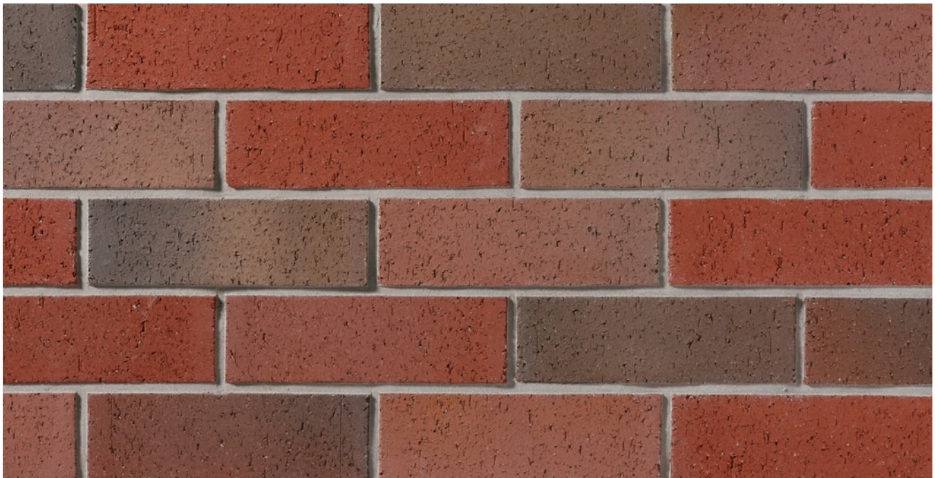
NEW! RED VELOUR FLASHED

AVAILABLE SIZES: Metric Modular, Modular, Premier Plus, Metric Norman, Metric Jumbo, Closure, Utility