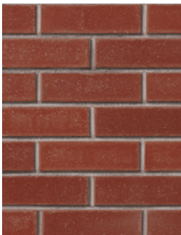
RED SMOOTH Modular