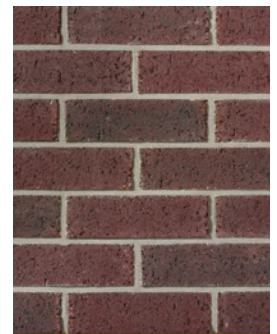
VALENCIA NEW! Modular