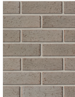
PEWTER NEW! Modular