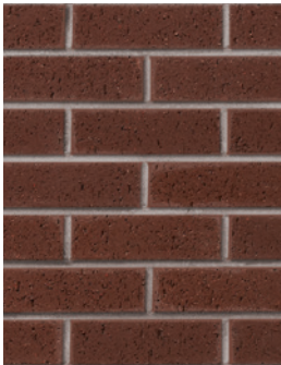
BROWN VELOUR Modular

Manufactured in our Farmersburg, Indiana plant.