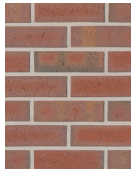
RED VELOUR, CROSS-FLASHED Modular