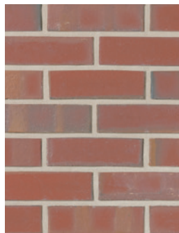
RED SMOOTH, CROSS-FLASHED Modular