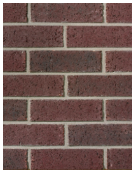
VALENCIA NEW! Modular