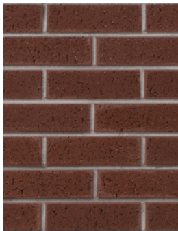
BROWN VELOUR Modular

Manufactured in our Farmersburg, Indiana plant.