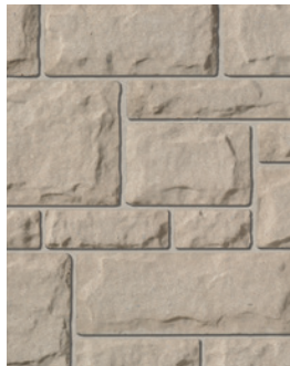
DOVER Multi Bundle