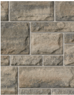
CHAMPAGNE Multi Bundle

All colours in the sizes shown are Stock Item Products. Manufactured in our Brampton, Ontario plant.