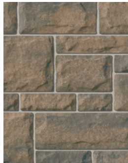
HARBOUR MIST Multi Bundle