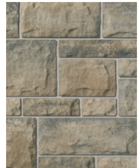
PICASSO Multi Bundle