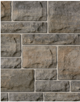
CHAMPAGNE Multi Bundle

All colors in the sizes shown are Stock Item Products. Manufactured in our Wixom, Michigan plant.