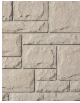
DOVER Multi Bundle