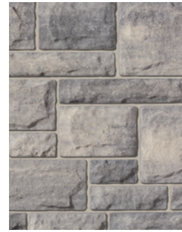
MARBLE GRAY Multi Bundle