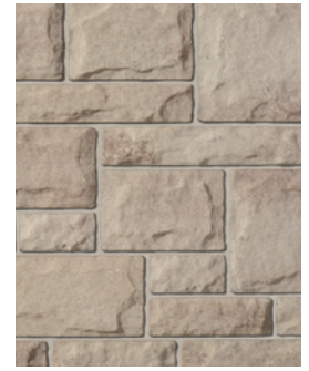
SHORELINE Multi Bundle