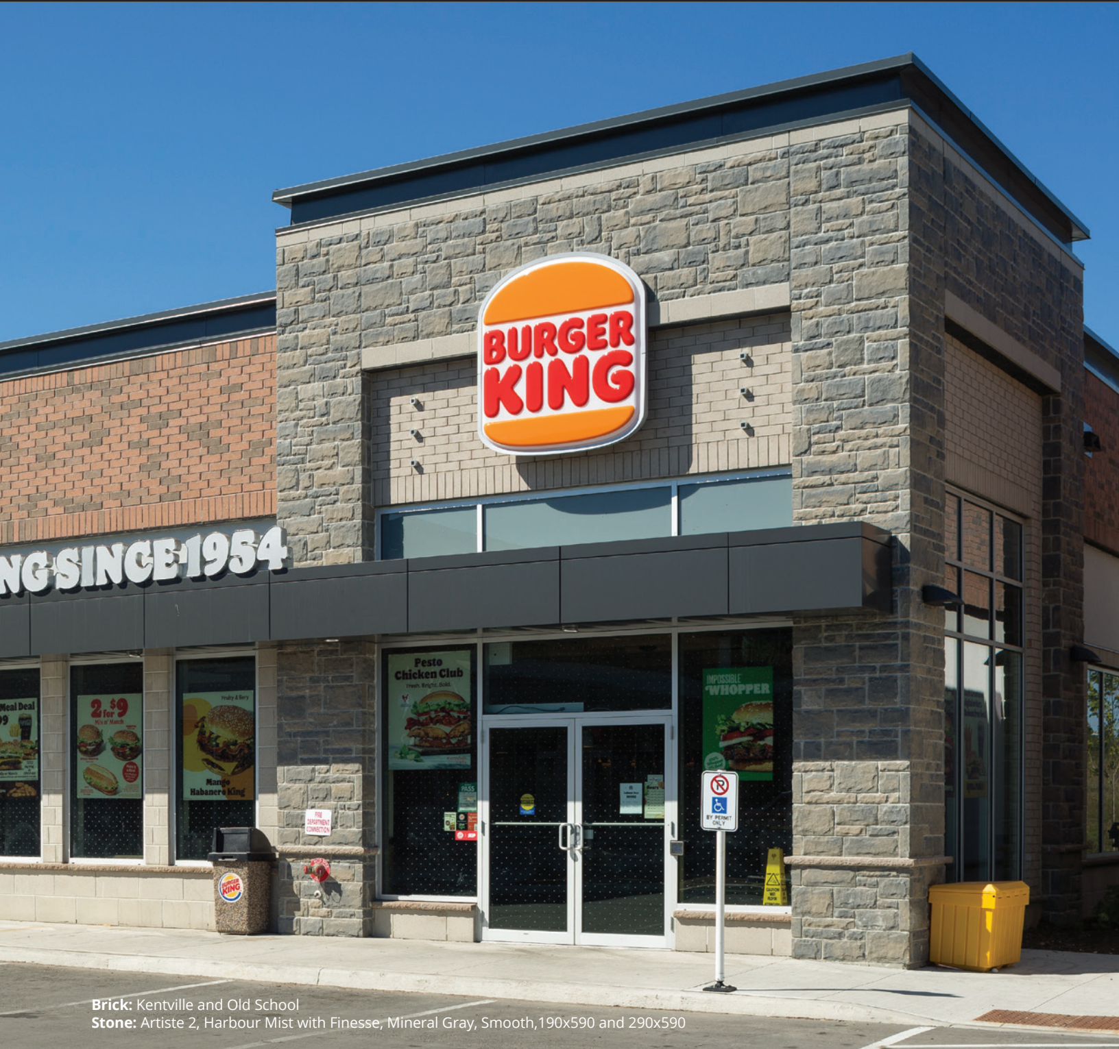
Brick: Kentville and Old School Stone: Artiste 2, Harbour Mist with Finesse, Mineral Gray, Smooth, 190x590 and 290x590

Artiste 2 stone is the next generation of our popular Artiste Stone Masonry: enhanced aesthetics like straight top and bottom edges and beautifully blended new earth tone colors help deliver cleaner lines and a more natural-looking hand-crafted stone appearance. Easier to install with even less waste than the original Artiste. Artiste 2 allows for a variety of configurations by mixing sizes, lengths and combining with other Brampton Brick clay and concrete products.