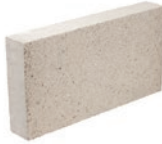
290 x 590 Stone Length 590 mm (23 1/4") Height 290 mm (11 3/8") Depth 90 mm (3 1/2") Courses out with Metric Brick and Block