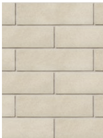
POLAR WHITE Sizes: 168 x 590, 257 x 590