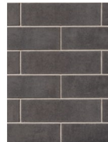
TWILIGHT Sizes: 168 x 590, 257 x 590