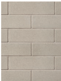
DOVER Sizes: 168 x 590, 257 x 590, 290 x 590