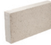
290 x 590 Stone 590 x 290 x 90 mm (23 1/4 x 11 3/8 x 3 1/2")

Courses out with Premier Plus and Artiste 2