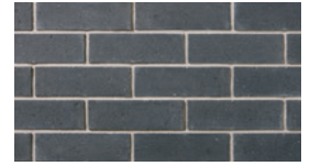
ONYX Sizes: Multi Bundle†, PRP†