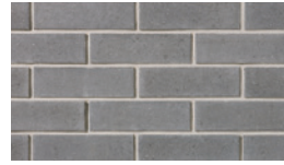
SHADOW Sizes: Multi Bundle†, PRP†