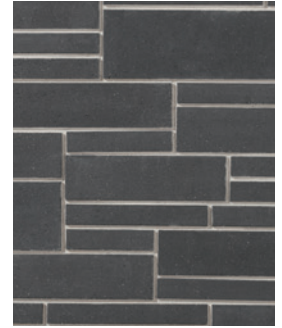
ONYX Sizes: Multi Bundle†, PRP†