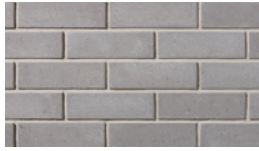
NICKEL Sizes: Multi Bundle†, PRP†