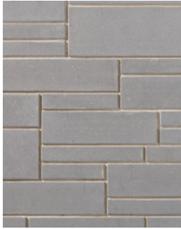
NICKEL Sizes: Multi Bundle†, PRP†