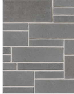
SHADOW Sizes: Multi Bundle†, PRP†