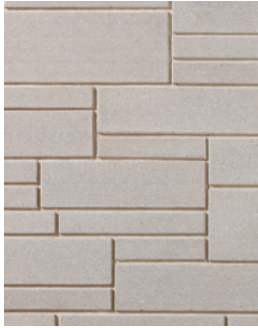
DOVER Sizes: Multi Bundle†, PRP†