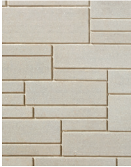
POLAR WHITE Sizes: Multi Bundle, PRP†