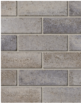
ASHLAND Premier Plus

All colours in the sizes shown are Stock Item Products. Manufactured in our Brampton, Ontario plant.