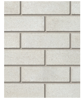
POLAR WHITE Premier Plus