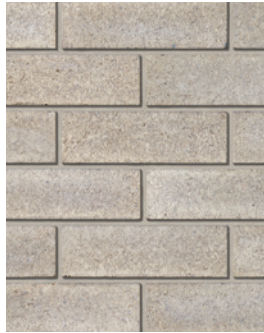
DOVER Premier Plus