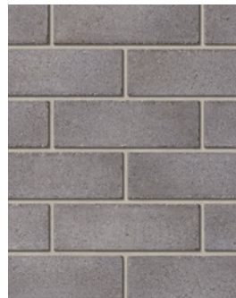
SHADOW Premier Plus