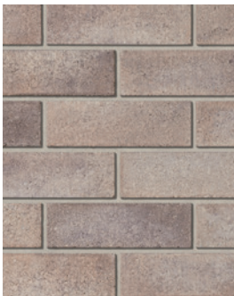
PALERMO BEIGE Premier Plus