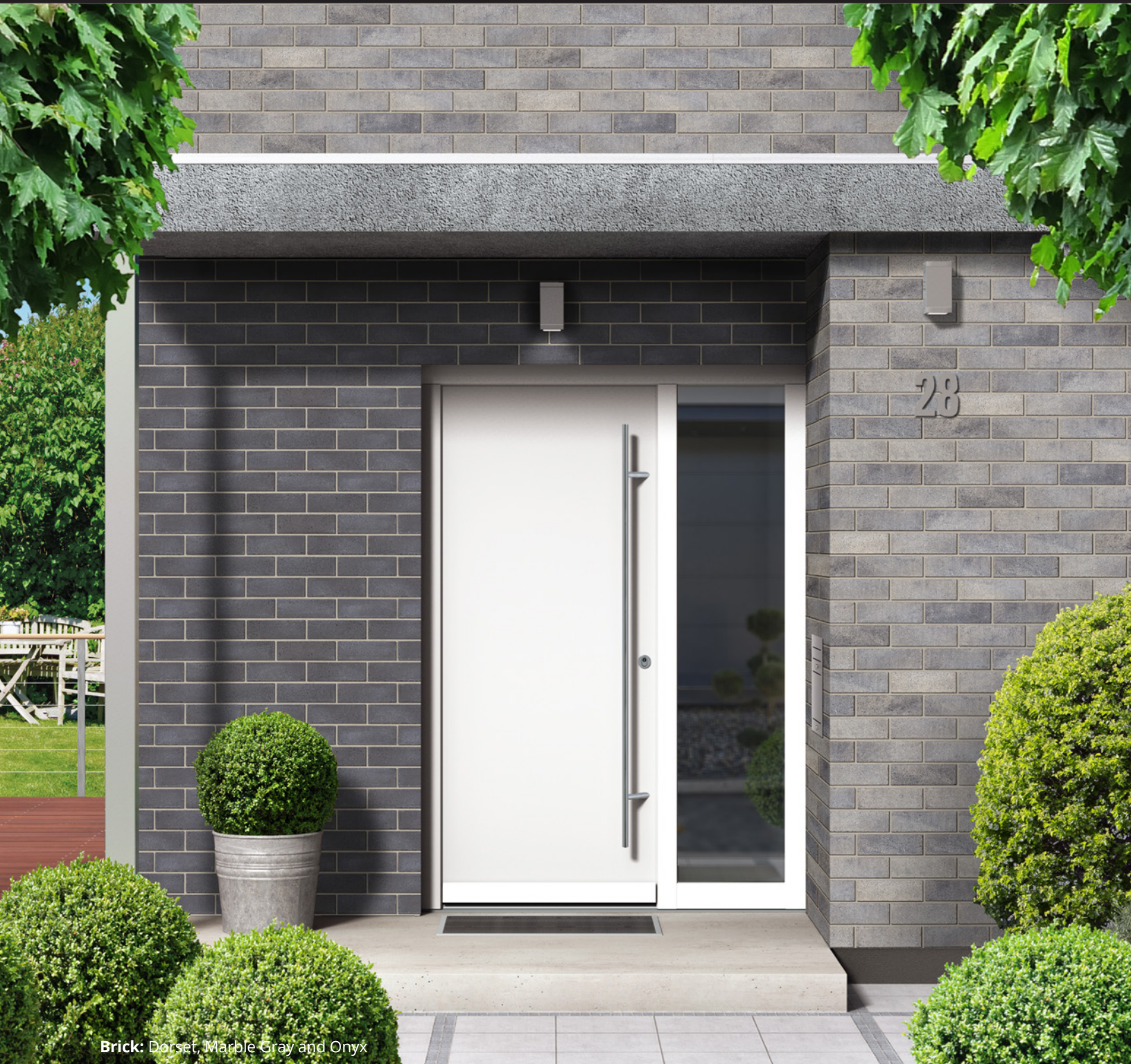
Brick: Dorset, Marble Gray and Onyx

Fresh, marbled colour compositions make Granada an adaptable stone for today's chic design trends. Offered in an array of alluring colours, Granada's unique textures combine easily with our clay and concrete bricks especially well with the sleek, smooth Contempo for unique design options.