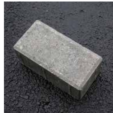
Figure 4. Spacer bars are small nibs on the sides of the pavers that provide a minimum joint spacing into which joint sand can enter.

A key aspect of this guide specification is dimensional tolerances of concrete pavers. For length and width tolerances, ASTM C936 allows \pm 1/16 in. ( \pm 1.6 mm) and CSA A231.2 allows \pm 2 mm. These are intended for manual installation and should be reduced to \pm 1.0 mm (i.e., \pm 0.5 mm for each side of the paver) for mechanically installed projects,