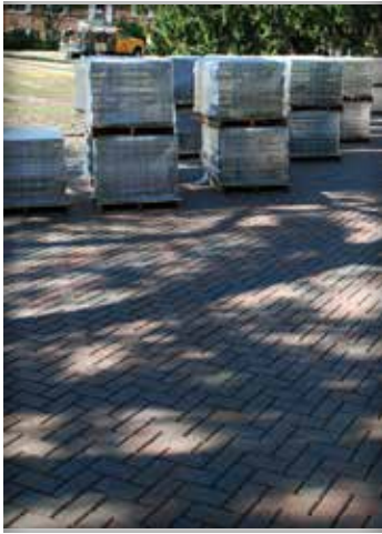
Figure 2. Bundles of ready-to-install pavers for setting by mechanical equipment. Bundles are often called cubes of pavers.

sand stabilization materials. ICPI Tech Spec 11–Mechanical Installation of Interlocking Concrete Pavements (ICPI 2015) should be consulted for additional information on design and construction with this paving method. Other references include American Society for Testing and Materials or the Canadian Standards Association for the concrete pavers, sands, and joint stabilization materials, if specified. Placement of the base, drainage and related