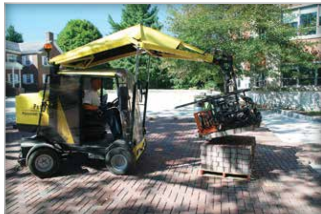
Figure 1. Mechanical installation of interlocking concrete pavements (left) and permeable units (right) is seeing increased use in industrial, port, and commercial paving projects to increase efficiency and safety.