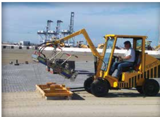
Figure 12. Sweeping jointing sand across the pavers is done after the initial compaction of the concrete pavers.

After initial compaction of the pavers, sweep and vibrate dry joint sand into the joints until all are completely filled with consolidated joint sand (see Figures 12 and 13). The number of passes and effort required to produce completely filled joints depends on many factors. Some of these include sand moisture, gradation and angularity, weather, plus the size, condition and adjustment of the vibrating plate, the thickness of the pavers, the configuration of the