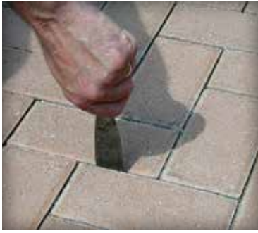
Figure 14. A simple test with a putty knife checks consolidation of the joint sand.

pavers and the skill of the vibrating plate operator.