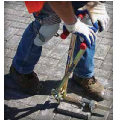
Figure 11. During initial compaction, cracked pavers are removed and immediately replaced with whole units.

in a running bond patterns. This supports the recommended use of herringbone patterns in vehicular areas.