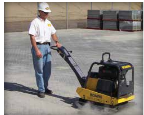
Figure 13. Final compaction should consolidate the sand in the joints of the concrete pavers.