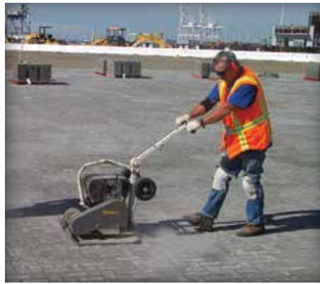
Figure 10. Initial compaction sets the concrete pavers into the bedding sand.