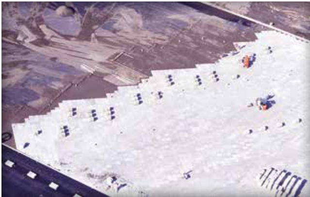
Figure 7. Maintaining an angular laying face that resembles a saw-tooth pattern facilitates installation of paver clusters.

bedding sand, as they may reflect to the paver surface in a few months.