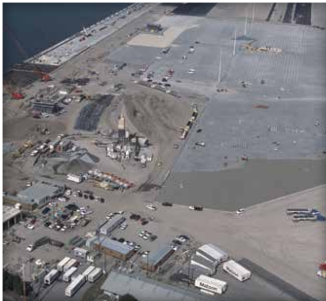
Figure 14. The Port of Oakland, California, is the largest mechanically installed project in the western hemisphere at 4.7 million sf (470,000 m 2 ).