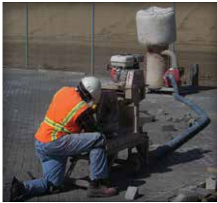
Figure 9. Edge pavers are saw cut to fit against a drainage inlet.