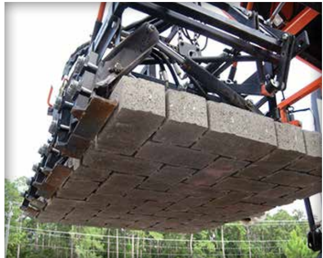
Figure 3. A cluster of pavers (or layer) is grabbed for placement by mechanical installation equipment. The pavers within the cluster are arranged in the final laying pattern as shown under the equipment.

A key component in the plan is a method statement by the manufacturer that demonstrates control of paver dimensional tolerances. This includes a plan for managing dimensional tolerances of the pavers and clusters so as to not interfere with their placement by paving machine(s)