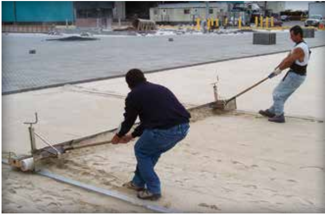
Figure 4. A two-man hand pulled screed