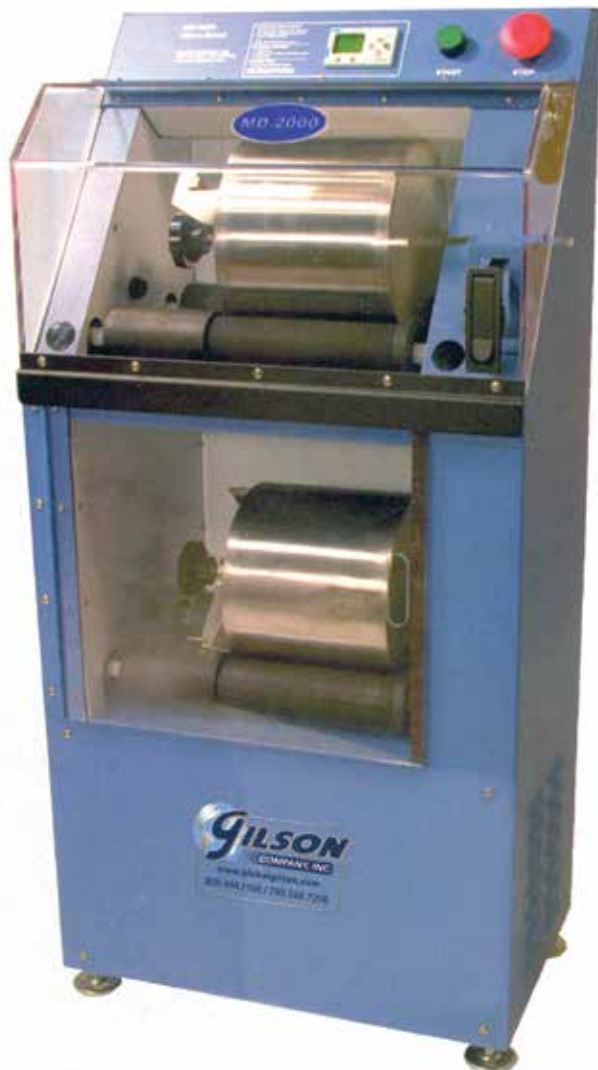
Figure 1. The Micro-Deval test apparatus.

The Micro-Deval test is evolving as the test method of choice for evaluating durability of aggregates in North America. Defined by CSA A23.2-23A, The Resistance of Fine Aggregate to Degradation by Abrasion in the Micro-Deval Apparatus (CSA 2004) and ASTM D 7428-08 Standard Test Method for Resistance of Fine Aggregate to Degradation by Abrasion in the Micro-Deval Apparatus , the test method involves subjecting aggregates to abrasive action from steel balls in a laboratory rolling jar mill. In the CSA test method a 1.1 lb (500 g) representative sample is obtained after washing to remove the No. 200 (0.080 mm) material. The sample is saturated for 24 hours and placed in the Micro-Deval stainless steel jar with 2.75 lb (1250 g) of steel balls and 750 mL of tap water (See Figure 1). The jar is rotated at 100 rotations per minute for 15 minutes. The sand is separated from the steel balls over a sieve and the sample of sand is then washed over an 80 micron (No. 200) sieve. The material retained on the 80 micron