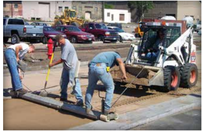
Figure 5. Mechanical screeding is the most efficient method of bedding sand installation

Role of Bedding Sand in Construction —Provided that the base was installed according to recommended construction practices and tolerances (See ICPI Tech Spec 2—Construction of Interlocking Concrete Pavements ), the bedding sand ensures that the pavers have a uniform slope and meet surface tolerances without surface undulations or “waviness.”