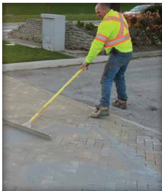
Figure 11. Sweeping in joint sand

The hot bitumen-sand bedding layer is placed, screeded to about \frac{3}{4} in. (20 mm) thick and compacted while remaining above 250° F (120° C) (Figures 4 and 5). This layer typically compacts about \frac{1}{8} in. (3 mm). The depth of this layer must be consistent. If the area does not have a curb to support a screed, screed bars are placed directly on the concrete base to guide the screed.