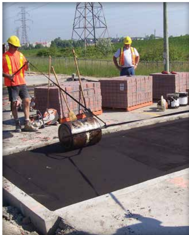
Figure 14. A water-filled roller compactor for compacting the bitumen-sand bedding.

ers are in place including cut units, sand is swept into the joints and pavers are compacted until the joints are full (Figures 11 and 12). For more efficient work, sand sweeping and compaction can be simultaneous. Unlike sand-set pavers, there is no need to compact the pavers without sand in the joints first. When completed, the pavement can accept traffic loading immediately (Figure 13).