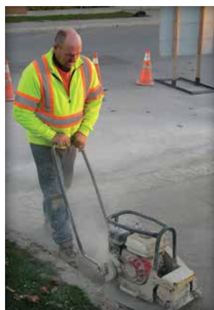
Figure 12. Once the pavers are in place, the joints are filled with dry joint sand and the surface is compacted.

A thin layer of neoprene-asphalt adhesive is then applied with a squeegee to the top of the bedding layer, and allowed to cure (typically 1 to 2 hours). Adhesives with a high viscosity are applied with a straight edged towel as shown in Figure 8. Adhesives with a low viscosity can be applied with a squeegee. The adhesive takes a hazy appearance when ready to mark baselines and place the concrete pavers (Figure 9). Only enough adhesive should be applied that will be covered with pavers in a day's work. Figure 10 shows the paver installation. Once the pavers are placed on the adhesive, they are very difficult to remove. If removed, they can pull up the adhesive and bitumen-sand bedding under the paver. Once all the pav-