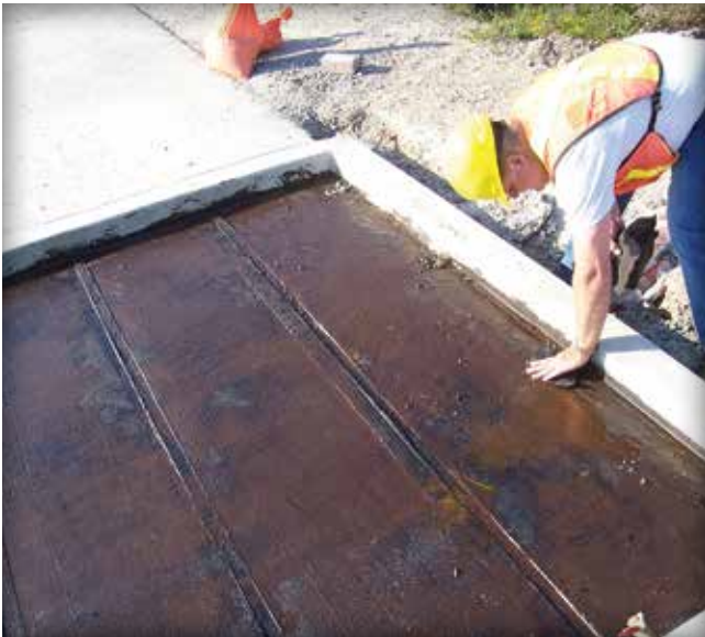
Figure 3. Confirming the tack coat has cured and is no longer wet to the touch.