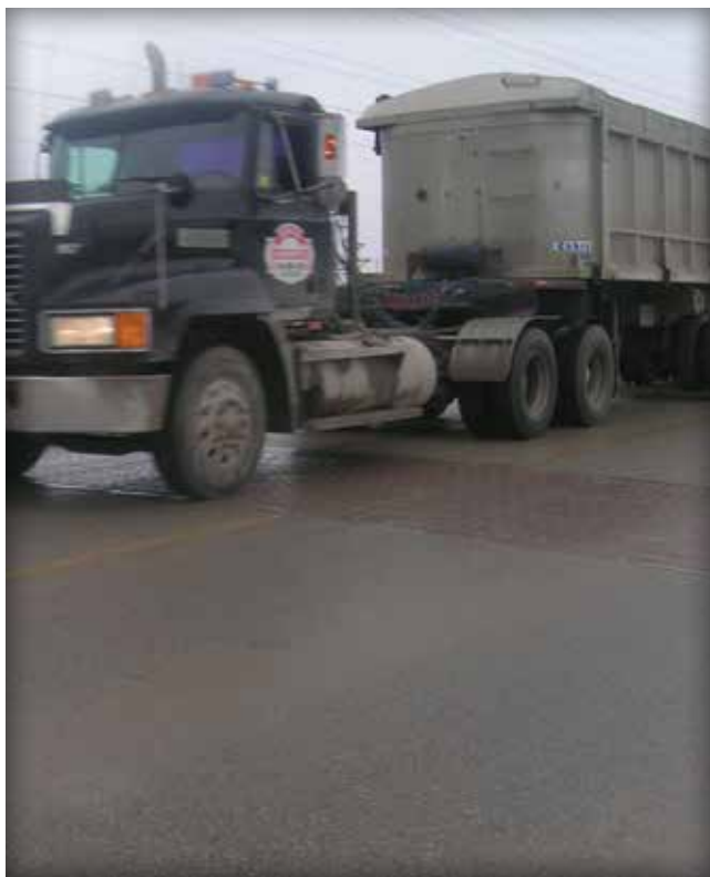
Figure 13. Crosswalk in use under heavy traffic.