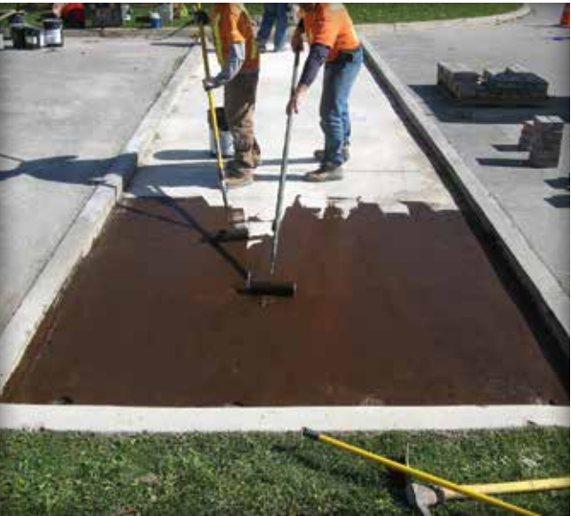
Figure 2. Emulsified asphalt tack coat is applied to a concrete base prior to applying the bitumen-sand mix.