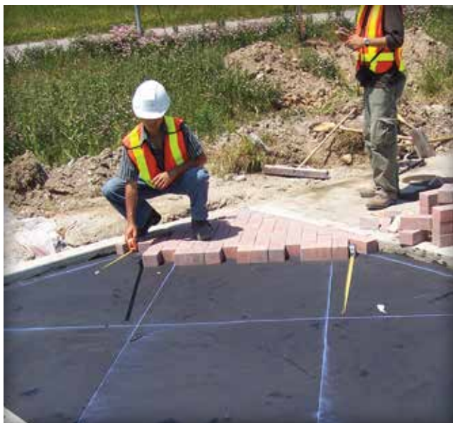
Figure 10. Cut pavers are added along the edges.

Best application results are typically achieved using a synthetic paint roller with a short nap. Once applied the tack coat should not be disturbed and should be allowed to cure before covering with the setting bed material. As the asphalt emulsion cures it should turn from a brown to black color (Figure 3). This may take a few hours depending on weather conditions. When using SS-1 and SS-1h asphalt emulsions the temperature should be between 70 and 160° F (20 to 70° C) to allow for proper curing. Asphalt tack coats are recommended for vehicular applications. They are typically not required in pedestrian applications.