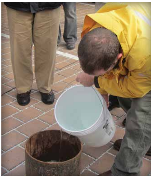
Figure 13. ASTM C1781: pouring the water into a 12 in. (300 mm) inside diameter ring set on plumber's putty.

ASTM C1781 test method begins with “pre-wetting” an area inside the ring to ensure the surface and materials beneath are wet. This is done by slowly pouring 8 lbs (3.6 kg) of water while not allowing the head of water on the paver surface to exceed \frac{3}{8} in. (10 mm) depth. If the time to infiltrate 8 lbs of water is less than 30 seconds (using a stopwatch typically on a cell phone), the subsequent test is done using 40 lbs (18 kg) of water. If more than 30 seconds, then 8 lbs of water is used in the subsequent tests. Again, a \frac{3}{8} in. (10 mm) head is maintained during the pour while being timed with a stopwatch. The surface infiltration rate is calculated using formulas in the test method.