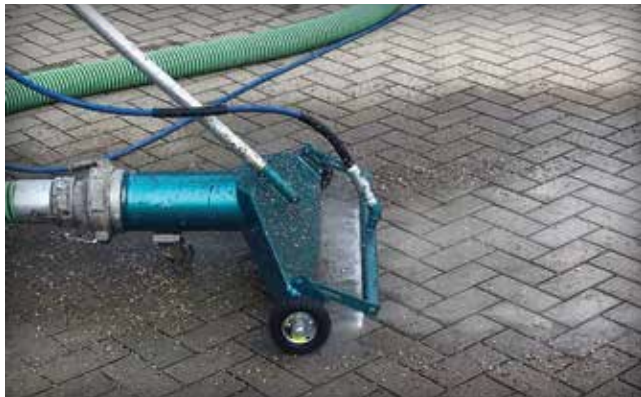
Figure 23. This equipment provides combined washing and vacuum of unmaintained PICP.