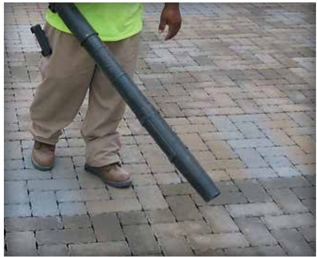
Figure 15. Blowing debris to curbs or gutters for removal and disposal.