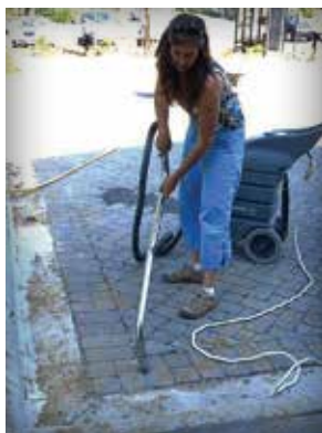
Figure 17. Wet/dry shop vacuum cleans loose sediment from a PICP residential driveway