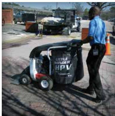
Figure 18. Walk-behind vacuum cleans a small parking area.