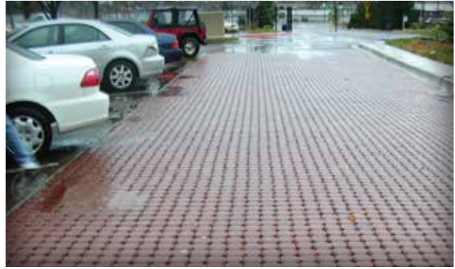
Figure 11. Ponding on PICP typically first occurs at the junction with impermeable pavement.