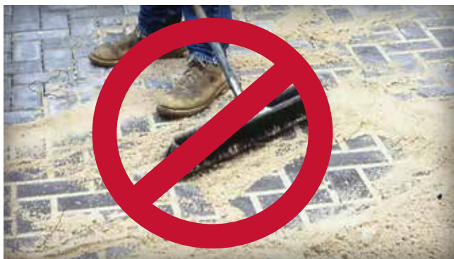
Figure 2. Sand-filled joints and bedding common to interlocking concrete pavement are not used in PICP.

Every PICP site varies in sediment deposition onto its surface, particle size distribution, and the resulting cleaning frequency. For example, beach sand (a coarse particle size distribution) on the surface will not clog as quickly and require less effort removing than fine clay sediment. Besides the particle size distribution, the rate of surface infiltration decline also depends on the traffic, size, and slope of a contributing impervious area, adjacent vegetation and eroding soil, paver joint widths and jointing stone sizes. ICPI offers a PICP site selection tool on www.icpi.org/resource-library/software-programs to help identify favorable sites and avoid one that may incur additional maintenance.