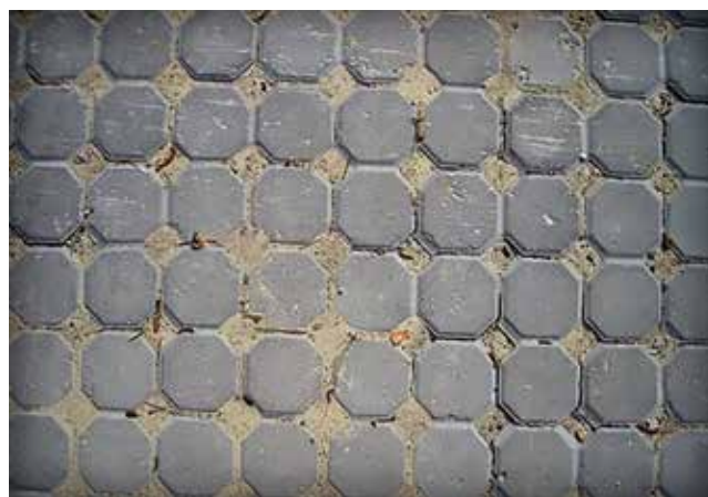
Figure 6. Sand from winter maintenance must be removed the following spring.