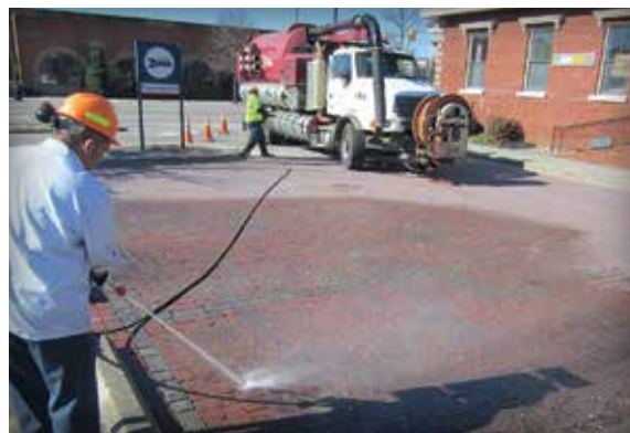
Figure 19. Power washing requires a little practice to minimize jointing stone removal.

opportunity on most sites to remove the water-suspended sediment before the water is absorbed back into the pavement. See Figure 19.