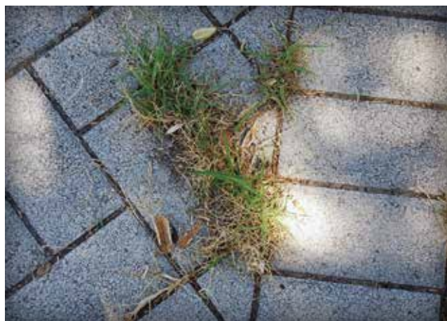
Figure 9. Weeds indicate sediment accumulation and lack of surface cleaning to remove it.

Inspect During and Just After a Rainstorm —The extent of puddles and bird baths observed during and especially after rainstorm indicate a need for surface cleaning. A minor amount of ponding is likely to occur particularly at transitions from impervious pavement surfaces to PICP. This often occurs first as sediment is transported by runoff and vehicles. See Figures 10 and 11. Should ponding areas occupy more than 20% of the entire PICP surface, then surface cleaning should be conducted. While a rainstorm's exact conclusion is difficult to predict, standing water on PICP for more than 15 minutes during or after a rainstorm likely indicates a location approaching clogging.