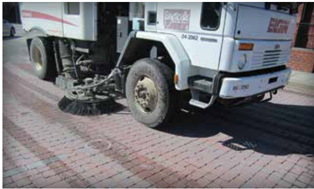
Figure 21. A regenerative air machine does routine cleaning in a PICP parking lot.