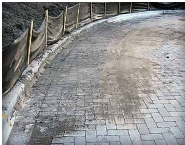
Figure 3. Whether eroded onto or dumped on PICP, erosion and sediment control are essential during construction.

Maintain filled joints with stones. The jointing stones capture sediment at the surface so it can easily be removed. If sediment is allowed to settle and consolidate, then cleaning becomes more difficult since the sediment is inside the joint rather than on the surface. Settlement of