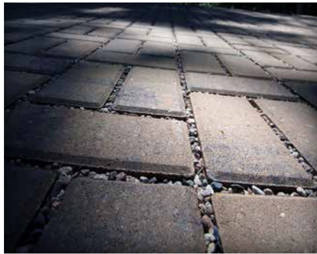
Figure 4. Keeping PICP joints filled with permeable aggregate facilitates removal of accumulated sediment.

jointing stones in the first few months is normal to PICP as open-graded aggregates for jointing and bedding choke into the larger base aggregates beneath and stabilize. This settlement often requires the joints to be refilled with aggregates three to six months after their initial installation. If possible, this should be included in the initial construction contract specifications. Aggregate-filled joints facilitate sediment removal at the surface.