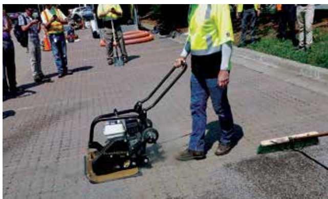
Figure 25. No matter the equipment used, after removing sediment soiled aggregate, clean aggregate is placed in the joints, the surface cleaned and compacted.