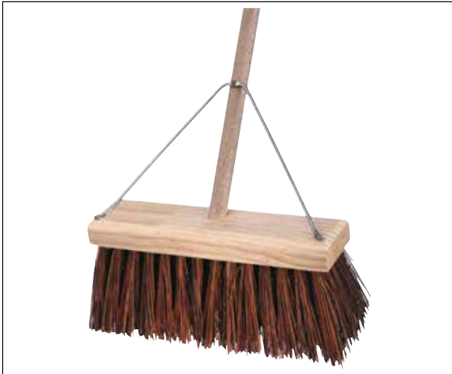
Figure 14. Bristle broom for removing loose debris