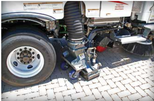
Figure 22. A true vacuum machine cleaning neglected PICP.