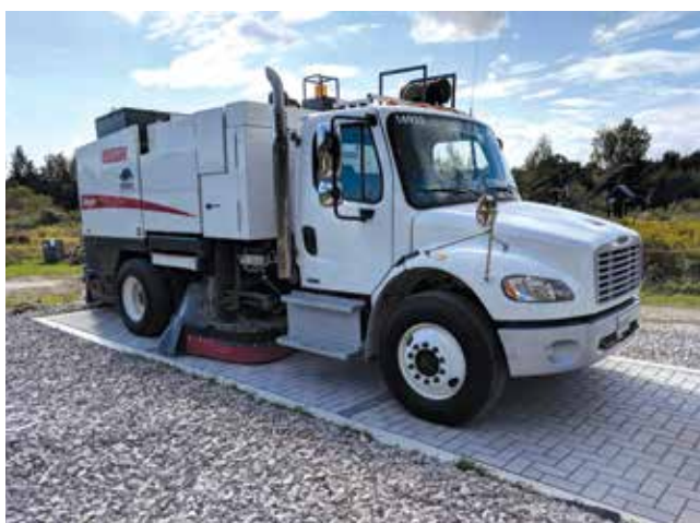
Figure 20. This type of mechanical sweeper removes sediment from joints parallel to the direction of the broom rotation.

True Vacuum Sweepers —These can withdraw jointing material and even the concrete pavers. Therefore, the vacuum engine revolutions must be adjusted by the