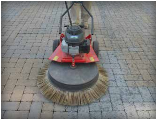
Figure 16. Rotary brushes increase cleaning efficiencies.