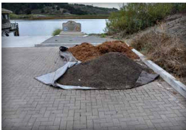
Figure 5. Mulch placed on tarps prevents more expensive cleaning of PICP.

Manage mulch, topsoil and winter sand. Finally, stockpiling mulch or topsoil on tarps or on other surfaces during site maintenance activities rather than directly on the PICP