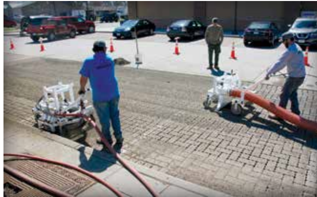
Figure 24. This equipment blows sediment and soiled aggregate from the joints and uses vacuum equipment to remove them.