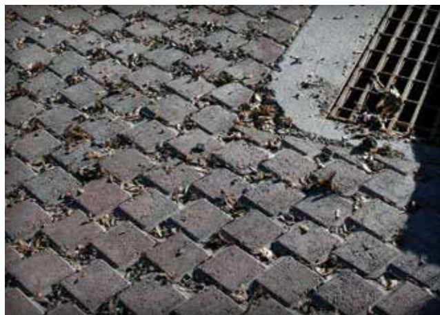
Figures 7 and 8. Pine needles and leaves eventually will degrade and get compacted into the joints from traffic. They should be removed by sweeping or vacuuming before that happens.

surface helps maintain infiltration. Figure 5 illustrates an example of correct management of landscaping material on PICP, as well as the need to exposed soil slopes.