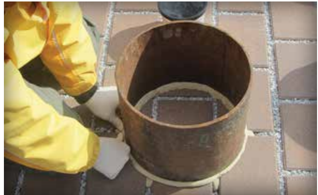
Figure 12. Steps in setting up test equipment for measuring surface infiltration using ASTM C1781.

Test Surface Infiltration —A quick and subjective test for the amount of surface infiltration is pouring water on PICP. If the water spreads rather than infiltrates, the extent of spreading suggests an area that may be clogging. Should more than approximately 20% of the surface area see ponding during or immediately after a rainstorm, a more objective measure of surface infiltration of these areas can