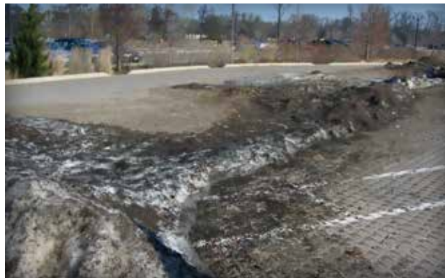
Figure 26. This is an example of snow that should have been deposited on a grassy area. If such areas are not available, then vacuum clean the PICP in the early spring.

Snow Removal —Unlike other permeable pavement surfaces, PICP demonstrates durability in the winter. PICP can be plowed with steel or hard rubber blades. Steel blades typically scratch all pavement surfaces. When using commercial snow removal companies, confirm in writing they provide protective edges on the snowplow equipment to avoid scratching the surface. Most pavers have chamfers on their surface edges which can help protect the edges from chipping by snow plows. For smaller areas, use a plastic snow shovel and fit snow blowers with plastic on the scoops and on the gliders. When possible deposit plowed snow onto grassy areas and not on the PICP when the plowed snow is dirty. Such dirt will remain and likely help clog the PICP surface after the snow melts.