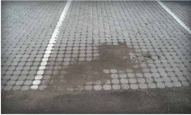
Figure 10. Erosion of adjacent asphalt and sediment deposition on PICP.