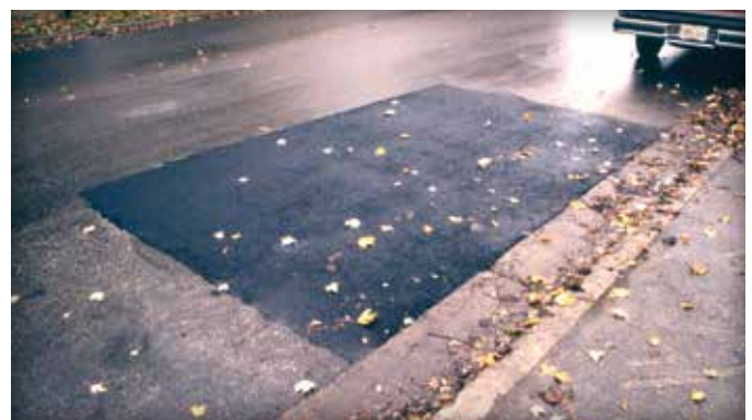
Figure 7. Pavement damage from settlement and shrinkage of cold patch asphalt.

Figures 2, 3, 4, 5 and 6 show the process of repair and illustrate the continuity of the paver surface after it is completed. The