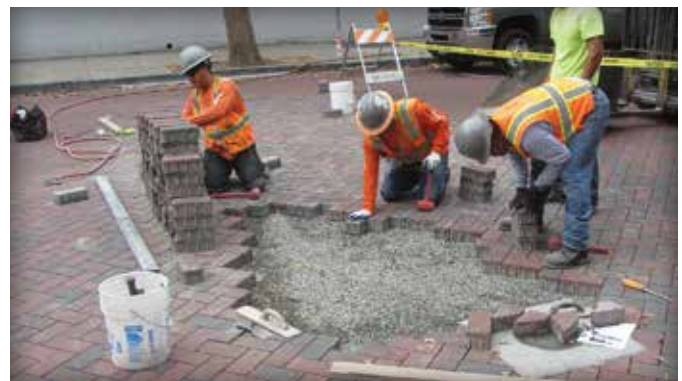
Figure 3. Once smoothed and joined with undisturbed materials at the opening perimeter, the bedding receives concrete pavers.