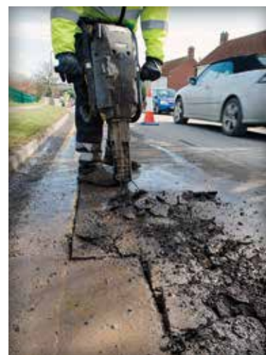
Figure 1. Repairs to utilities are a common sight in cities, incurring costs to cities and taxpayers.

The report concludes that while San Francisco has some of the highest standards for trench restoration, utility cuts produce damage that extends beyond the immediate trench. "...even the highest restoration standards do not remedy all the damage. Utility cuts cause the soil around the cut to be disturbed, cause the backfilled soil to be compacted to a different degree than the soil around the cut, and produce discontinuities in the soil and wearing