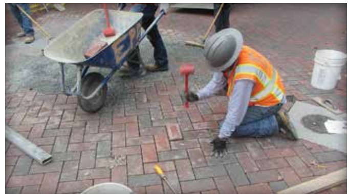
Figure 5. The final paver is inserted, the reinstated area compacted, joints filled, and compacted again. There are not cuts or damage to the pavement surface.