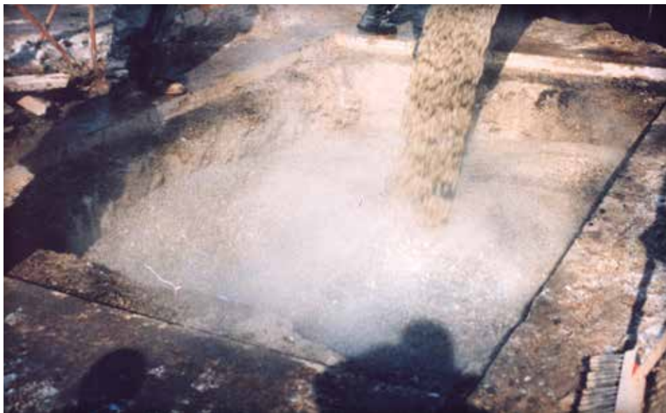
Figure 8. Low density concrete fill (unshrinkable fill) poured into a utility trench from a ready-mix concrete truck.

reinstated units are knitted into existing ones through the interlocking paving pattern and sand filled joints. Besides providing a pavement surface without cuts, the joints distribute loads by shear transfer. The joints allow minor settlement in the pavers caused by discontinuities in the base or soil without cracking.