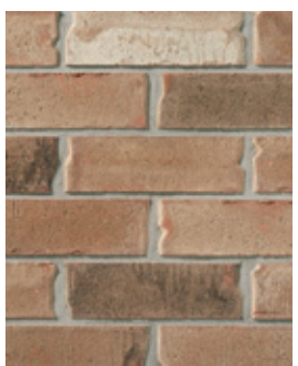
MANCHESTER Premier Plus †