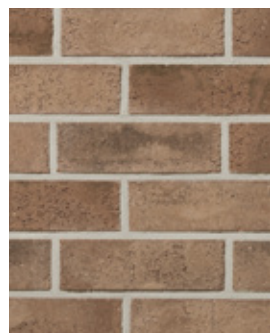
VERIDIAN Premier Plus †