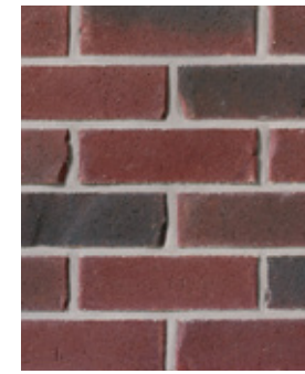
CRIMSON Premier Plus †