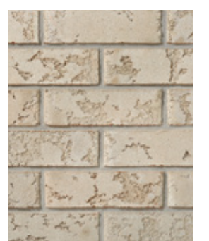
STERLING GRAY Premier Plus †