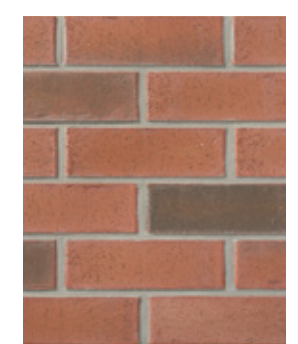
OLD SCHOOL Premier Plus