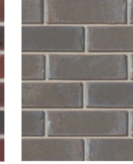
CRYSTAL GRAY Premier Plus †