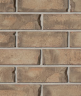
WESTMONT Premier Plus †