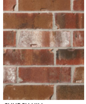
CHURCH HILL Premier Plus †