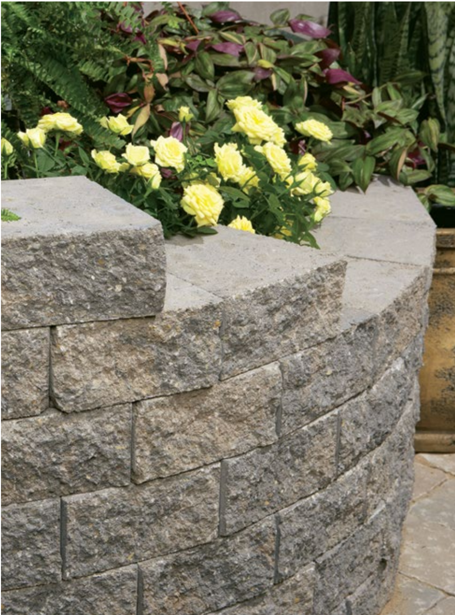
Wall: Modeco One, Chartan