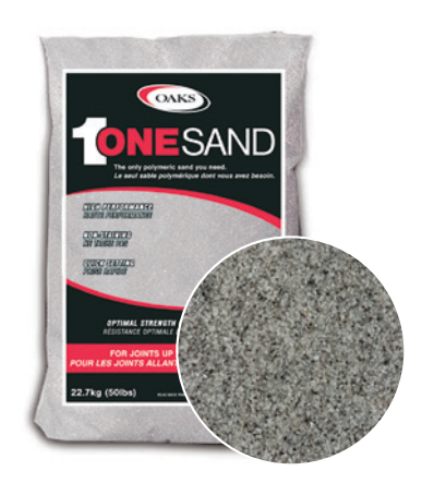
Granite Grey 50lb (22.7kg) bag 63 bags/skid