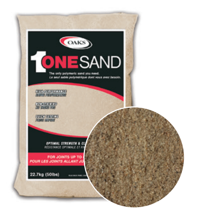
Canvas Beige 50lb (22.7kg) bag 63 bags/skid