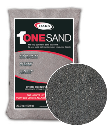
Absolute Black 50lb (22.7kg) bag 63 bags/skid