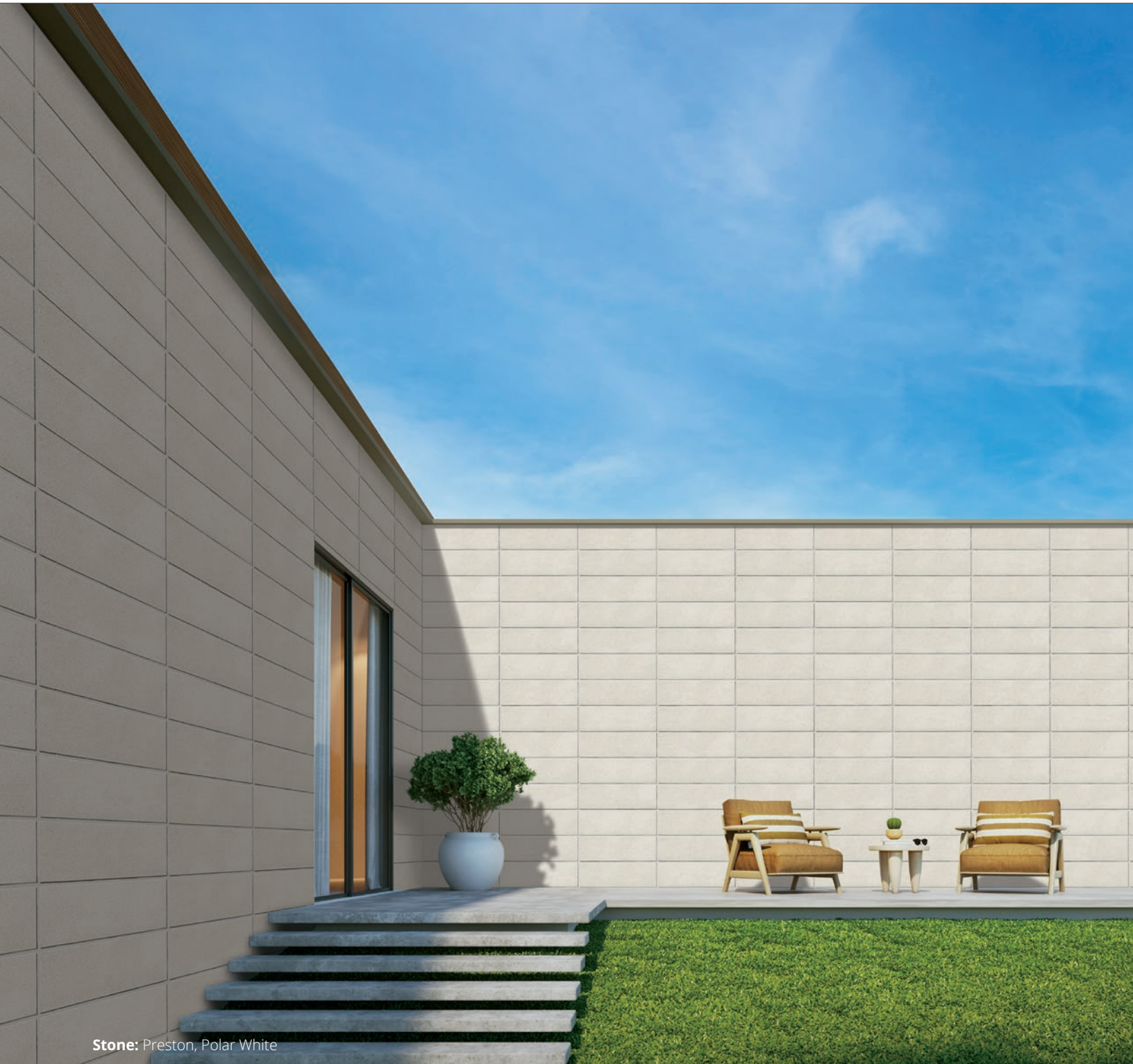
Stone: Preston, Polar White

Preston stone embodies the solid look of modern concrete stone veneer with a smooth face and clean lines in harmony with today's design trends. Stocked in established, natural colours; Preston's modular proportions make it the perfect companion for other metric brick and block in our wide range of masonry products.