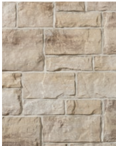
TWEED Sizes: Combo, Large Combo