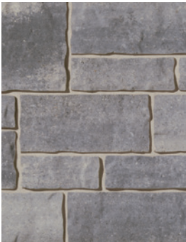
MONUMENT Multi Bundle