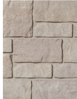
LAKESHORE Multi Bundle