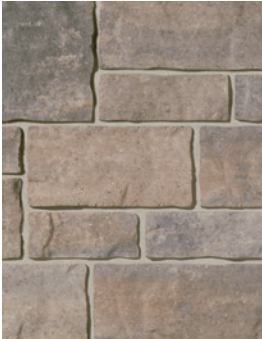
COBBLESTONE Multi Bundle

All colors in sizes shown are Stock Item Products. Manufactured in our Wixom, Michigan plant.