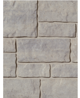
MONASTERY Multi Bundle