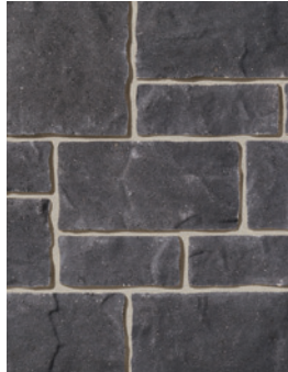
FOUNDRY Multi Bundle