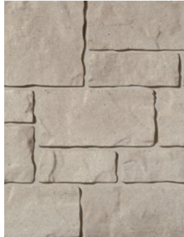
DOVER Multi Bundle